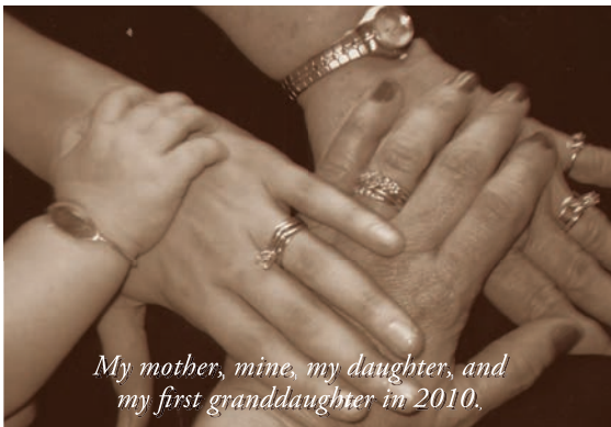
My mother, mine, my daughter, and my first granddaughter in 2010.

I have always been fascinated with hands. I love to see elderly people's hands and think of all the many things they have accomplished. When I look at my hands now, wearing my parent's rings, I can still visualize their hands and how they served so willingly. Stop and think about how your hands have served you, as well as others. Though our hands are similar in physical appearance, they are different because of how they are used. Our hands reflect our innermost selves. We clench our fists when we are angry. We wring our hands when we are stressed or worried. As children, we were taught to fold our hands to pray. We wipe tears from our eyes when we are sad. Hands can appear beautiful even when calloused and soiled after a hard day's work. My husband's hands consistently show how hard he worked to provide for our family.