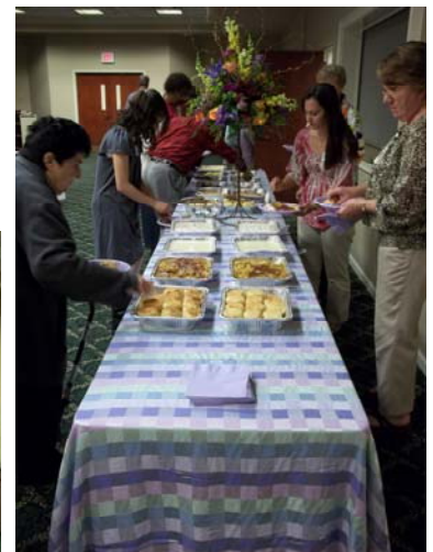
Volunteers enjoying breakfast and entertainment at our Appreciation Breakfast.

Our Board of Directors and Staff would like to say a very special "Thank You" to You!