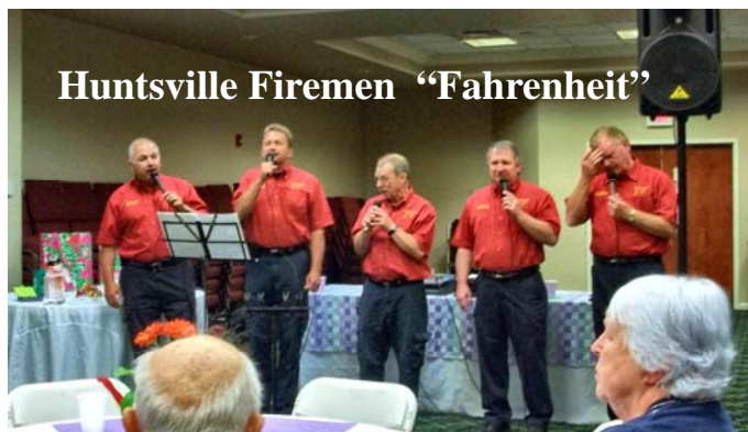
Huntsville Firemen "Fahrenheit"